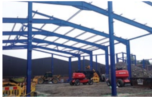
The footings have been established and the steel frame is now in place

Exol's head office and manufacturing site redevelopment is starting to gather pace and at the time of going to press, the landscape is looking markedly different than these pictures suggest.